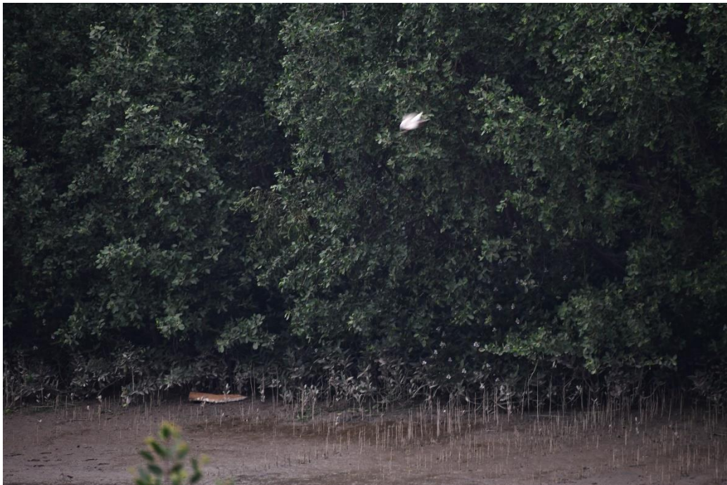
Appendix O.2.2.b: Active night roost on Sonneratia apetala and S. caseolaris mangrove roosting substrate located east of the Project boundary observed on 16 April 2021 around 18:05