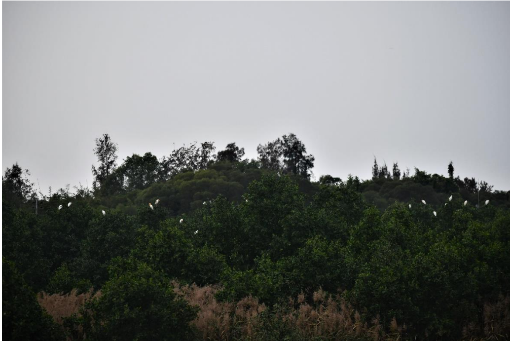
Appendix O.2.2.a: Active night roost on Sonneratia apetala and S. caseolaris mangrove roosting substrate located northeast of the Project boundary observed on 16 April 2021 around 18:19