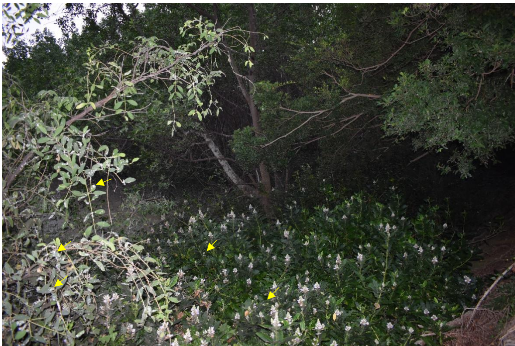
Appendix O.2.3b: Bird droppings on leaf surfaces of the mangrove Sonneratia apetala and Spiny Bears Breech Acanthus ilicifolius located east of the Project boundary observed on 16 April 2021 around 18:05