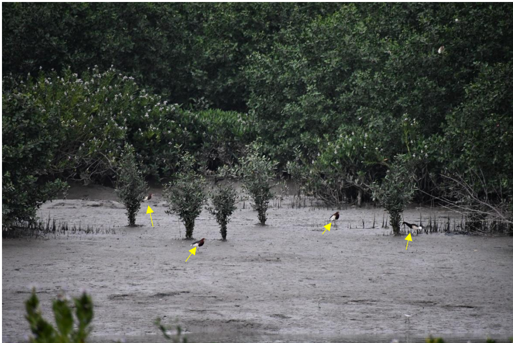
Appendix O.2.1b: Pre-roost aggregate of Chinese Pond Heron northeast of the Project boundary observed on 16 April 2021 around 17:55