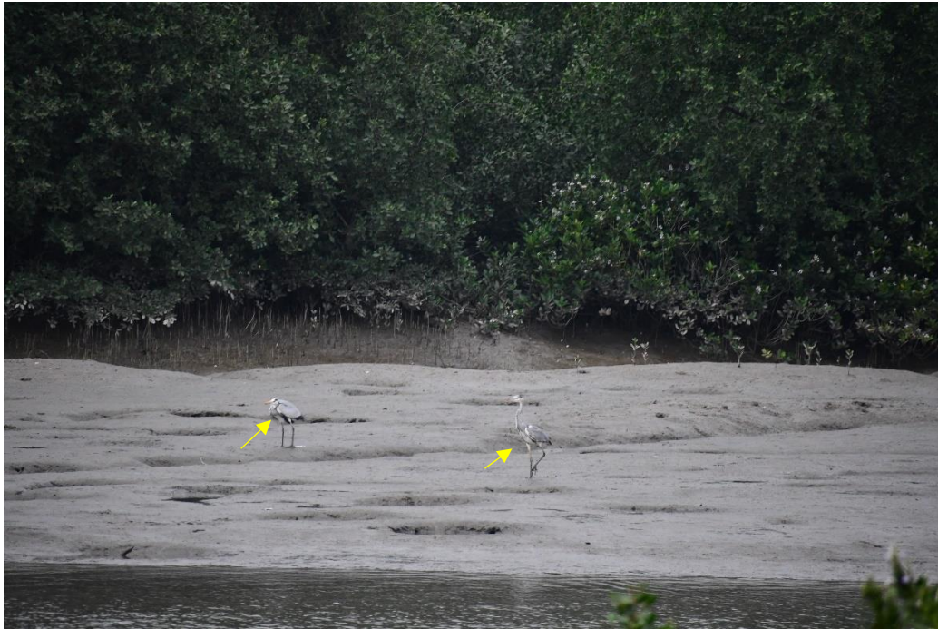
Appendix O.2.2a: Pre-roost aggregate of Grey Heron northeast of the Project boundary observed on 16 April 2021 around 17:48