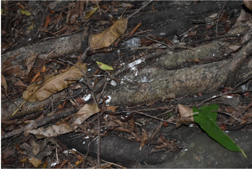
Appendix O.2.3a: Bird droppings on leaf litter and roots within the vicinity of the mangrove strip east of the Project boundary observed on 16 April 2021 around 18:05