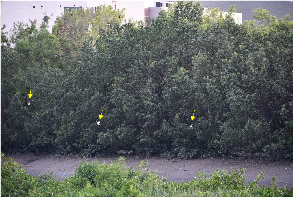
Appendix O.2.2: Active night roost on Sonneratia apetala and S. caseolaris mangrove roosting substrate located east of the Project boundary observed on 11 June 2021 around 18:50