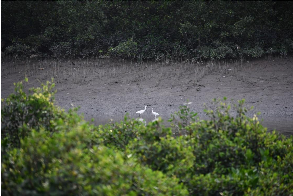
Appendix O.2.1a: Pre-roost aggregate of the Little Egret in the mudflat area east of the Project boundary observed on 11 June 2021 around 18:22