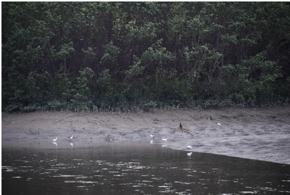
Appendix O.2.1b: Pre-roost aggregate of the Little Egret in the mudflat area northeast of the Project boundary observed on 11 June 2021 around 18:22