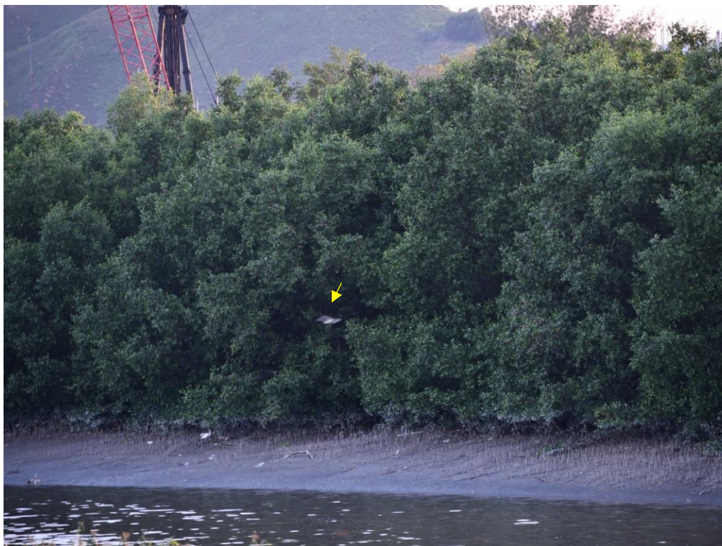
Appendix O.2.2b: Another angle of the active night roost on Sonneratia apetala and S. caseolaris mangrove roosting substrate still located east of the Project boundary observed on 20 August 2021 around 18:20