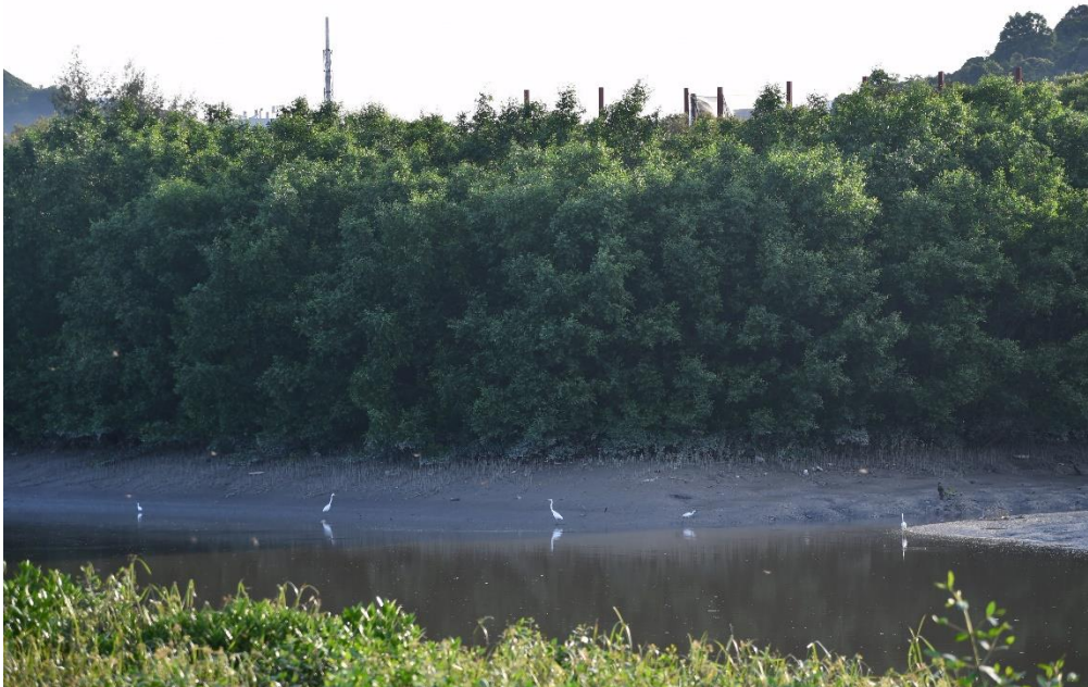
Appendix O.2.1a: Pre-roost aggregate of the Eastern Cattle Egret Bubulcus coromandus and Little Egret Egretta garzetta in the mudflat area east of the Project boundary observed on 20 August 2021 around 17:56