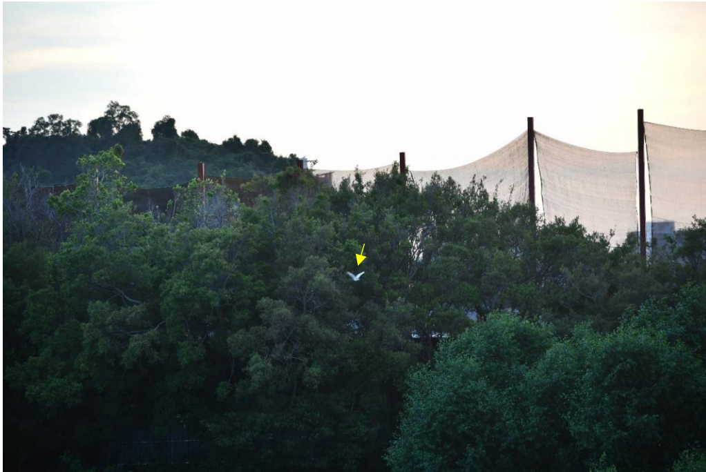
Appendix O.2.2a: Active night roost on Sonneratia apetala and S. caseolaris mangrove roosting substrate located east of the Project boundary observed on 20 August 2021 around 18:20