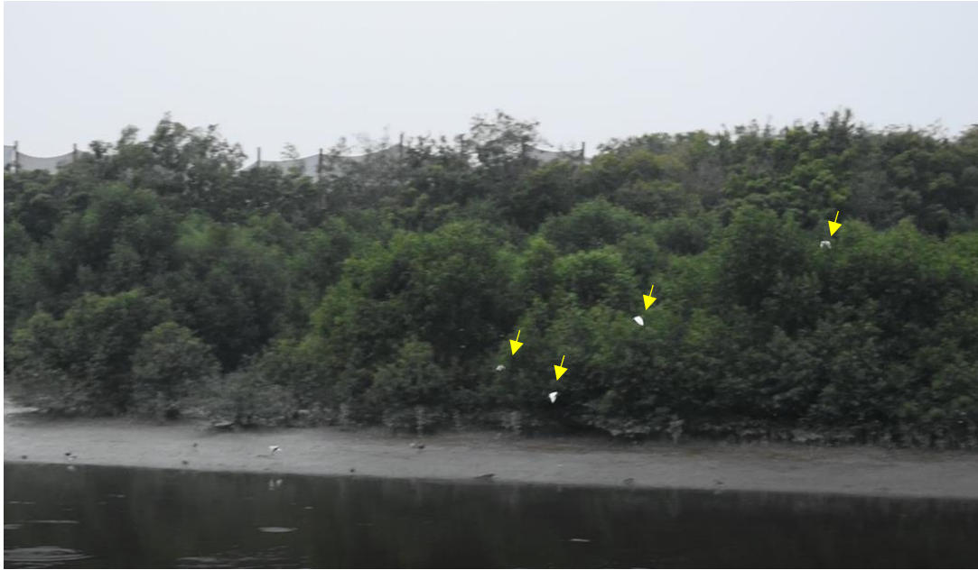
Appendix O.2.2b: Active night roost on Sonneratia apetala and S. caseolaris mangrove roosting substrate located northeast of the Project boundary observed on 19 November 2021 around 17:58