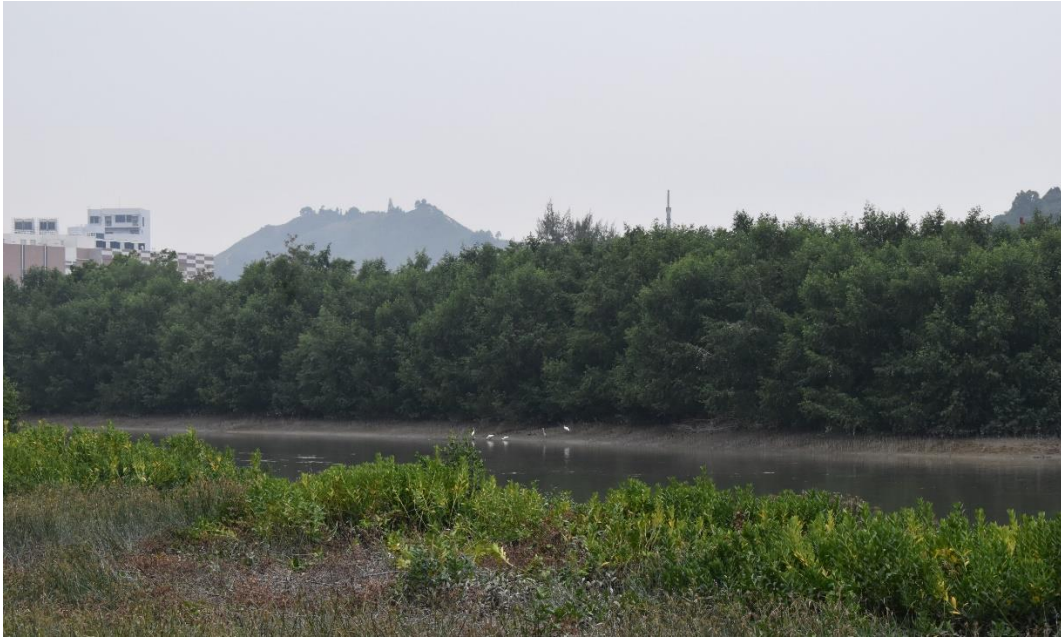
Appendix O.2.1a: Pre-roost aggregate of Intermediate Egret Egretta intermedia in the mudflat area east of the Project boundary observed on November 2021 around 17:04