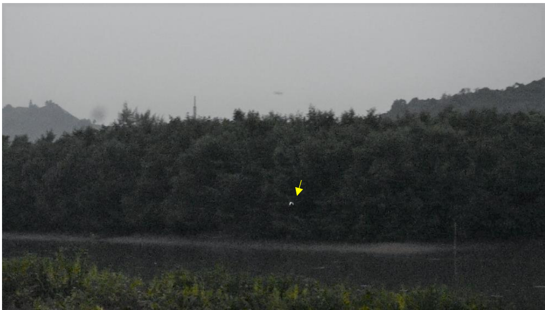
Appendix O.2.2a: Active night roost on Sonneratia apetala and S. caseolaris mangrove roosting substrate located east of the Project boundary observed on 19 November 2021 around 17:58