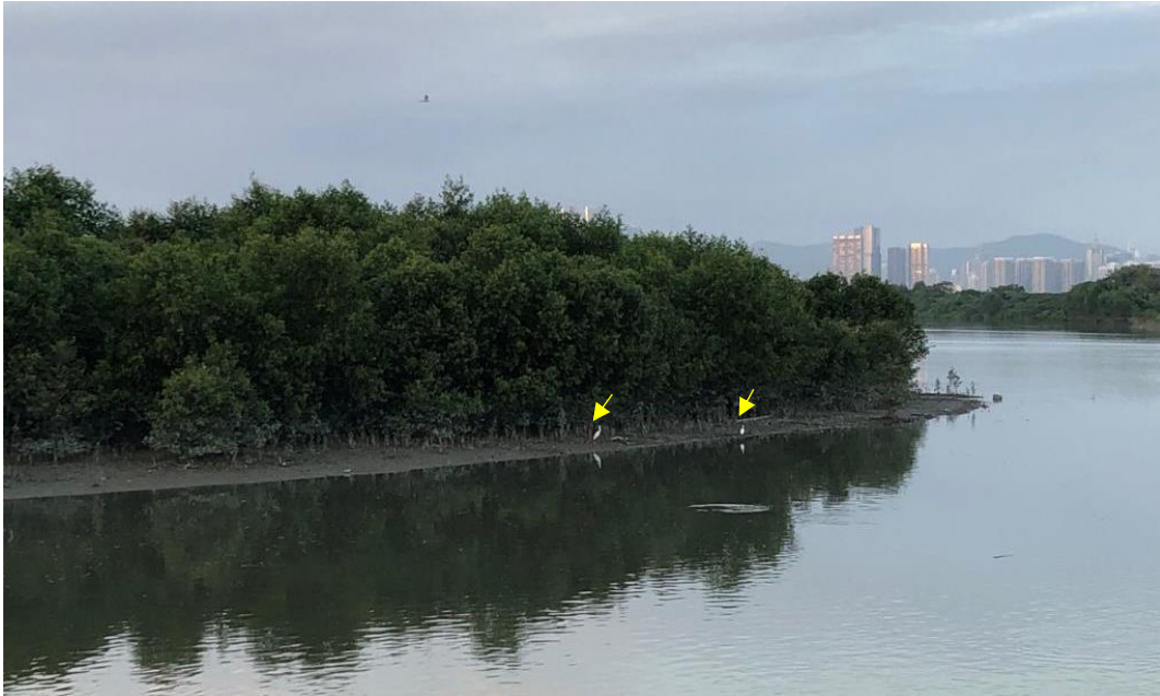
Appendix O.2.1a: Pre-roost aggregate of Little Egret Egretta garzetta in the tidal-inundated mudflat area northeast of the Project boundary observed on 16 December 2021 around 17:15