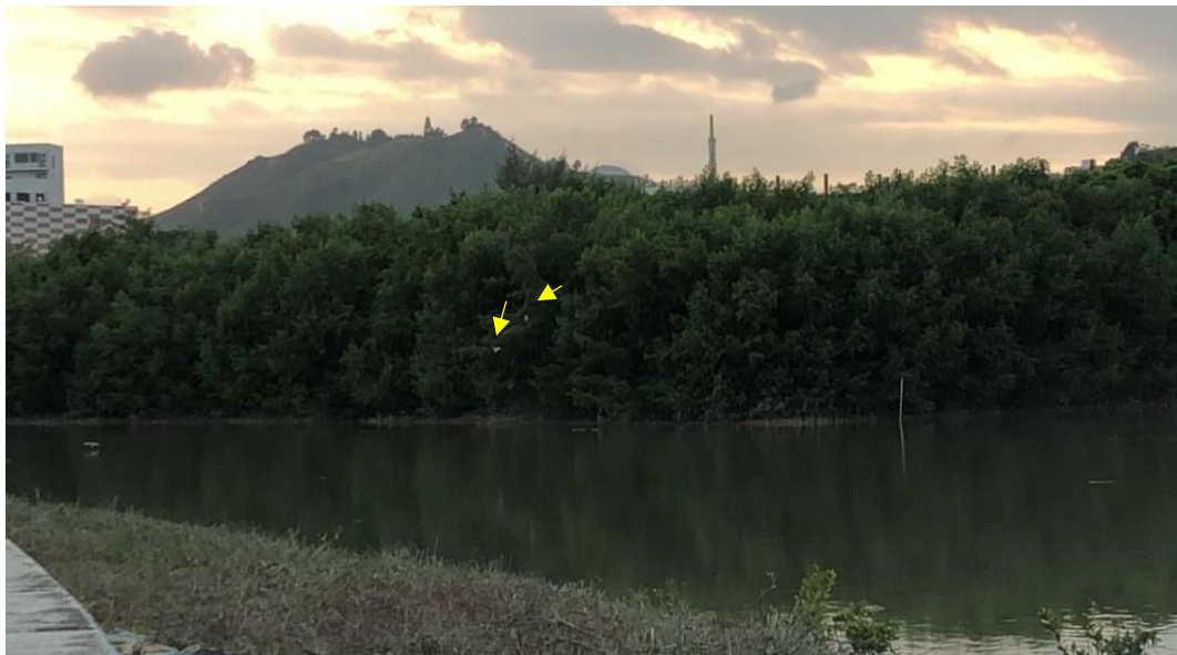
Appendix O.2.2a: Active night roost on Sonneratia apetala and S. caseolaris mangrove roosting substrate located east of the Project boundary observed on 16 December 2021 around 17:35