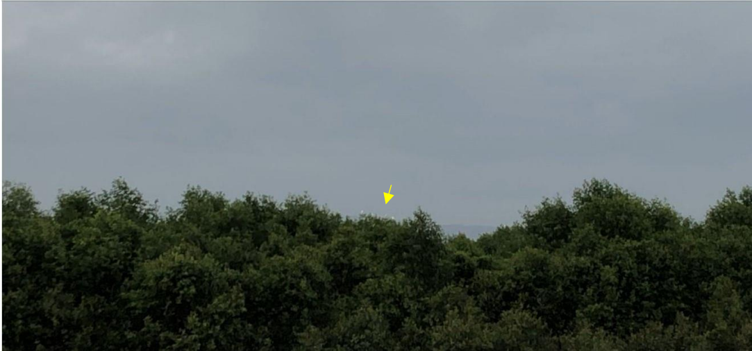
Appendix O.2.2b: Active night roost on Sonneratia apetala and S. caseolaris mangrove roosting substrate located northeast of the Project boundary observed on 16 December 2021 around 17:35