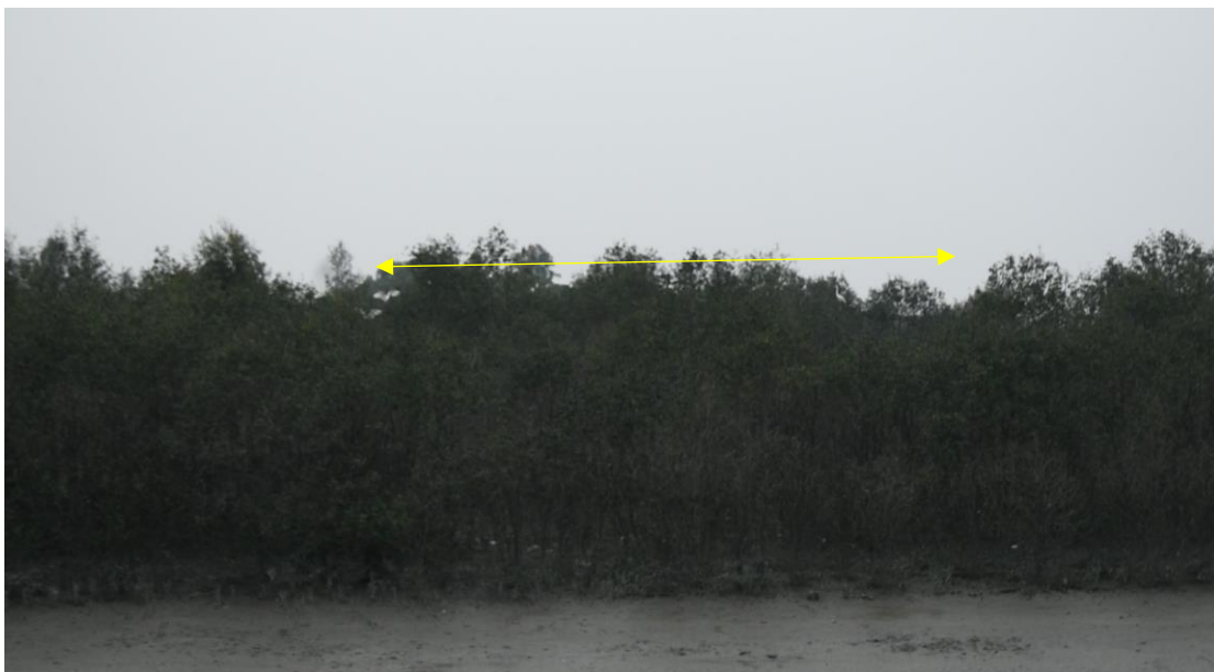
Appendix O.2.2b: Active night roost on Sonneratia apetala and S. caseolaris mangrove roosting substrate located northeast of the Project boundary observed on 18 March 2022 around 18:15