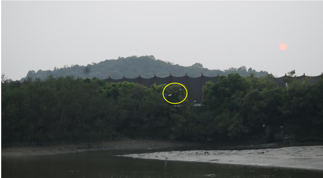
Appendix O.2.2a: Active night roost on Sonneratia apetala and S. caseolaris mangrove roosting substrate located east of the Project boundary observed on 18 March 2022 around 18:15