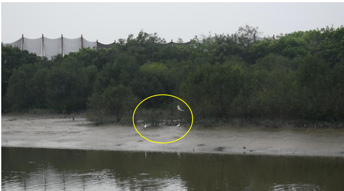
Appendix O.2.1b: Pre-roost aggregate of Intermediate Egret Egretta intermedia and Little Egret Egretta garzetta in the mudflat area northeast of the Project boundary observed on 18 March 2022 around 17:35