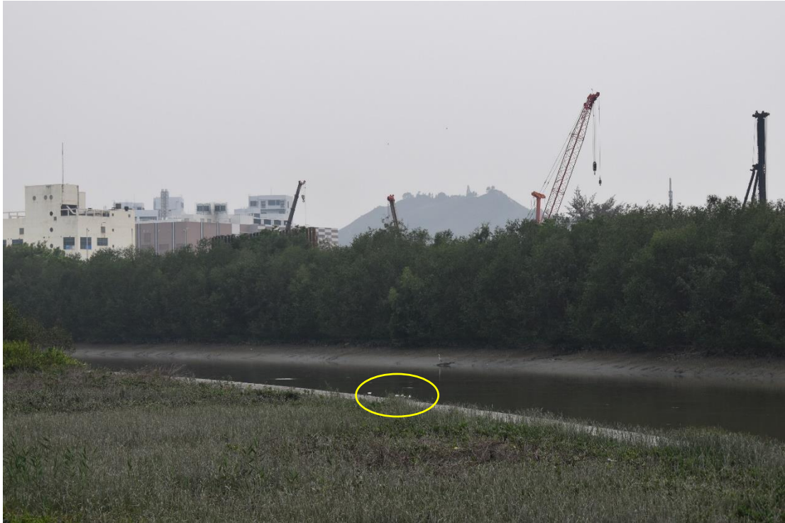
Appendix O.2.1a: Pre-roost aggregate of Chinese Pond Heron Ardeola bacchus and Intermediate Egret Egretta intermedia in the mudflat area east of the Project boundary observed on 18 March 2022 around 17:35