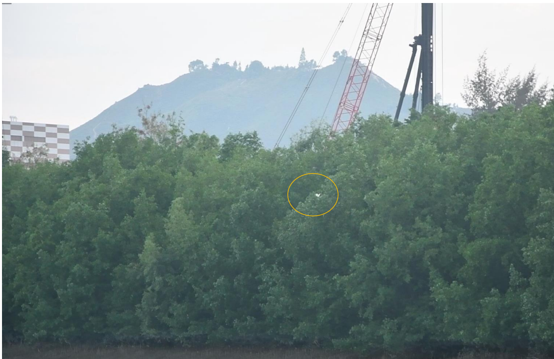
Appendix O.2.2a: Active night roost on Sonneratia apetala and S. caseolaris mangrove roosting substrate located east of the Project boundary observed on 21 April 2022 around 18:59