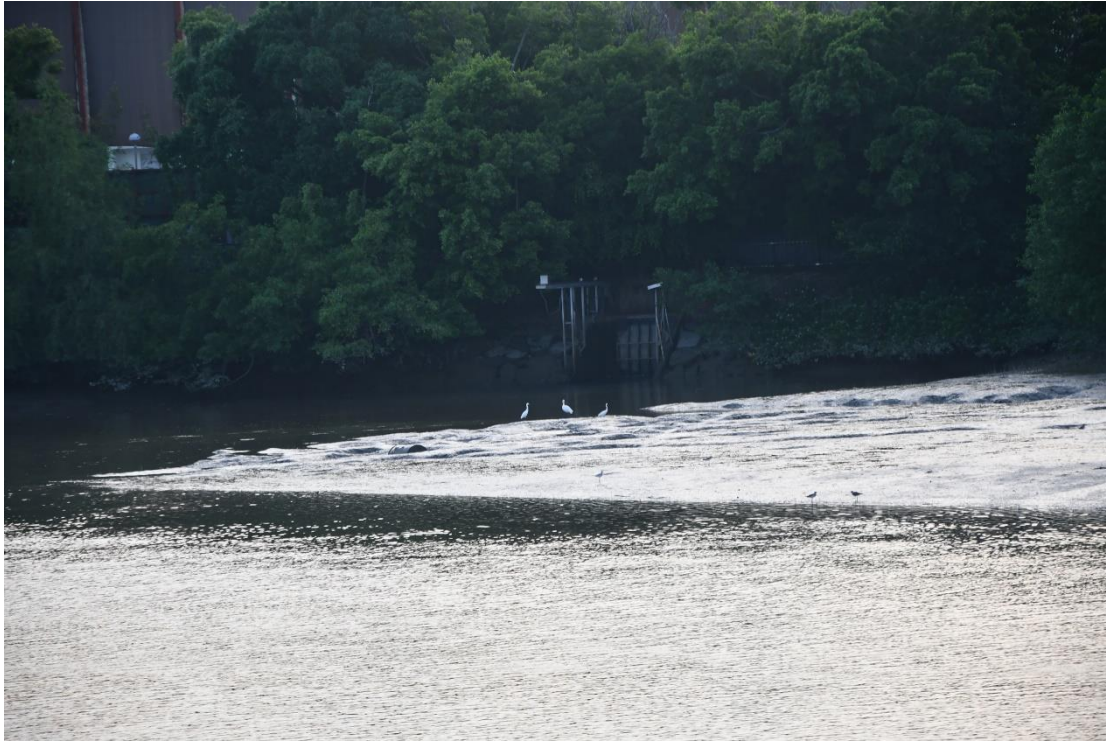
Appendix O.2.1: Pre-roost aggregate of Little Egret Egretta garzetta in the mudflat area east of the Project boundary observed on 21 April 2022 around 18:35