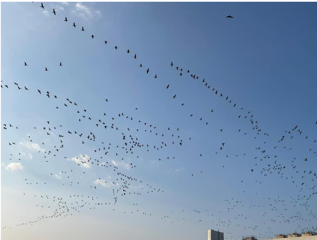
Annex G.2. Flock of Great Cormorants in Nam Sang Wai, far east of the Project Site.