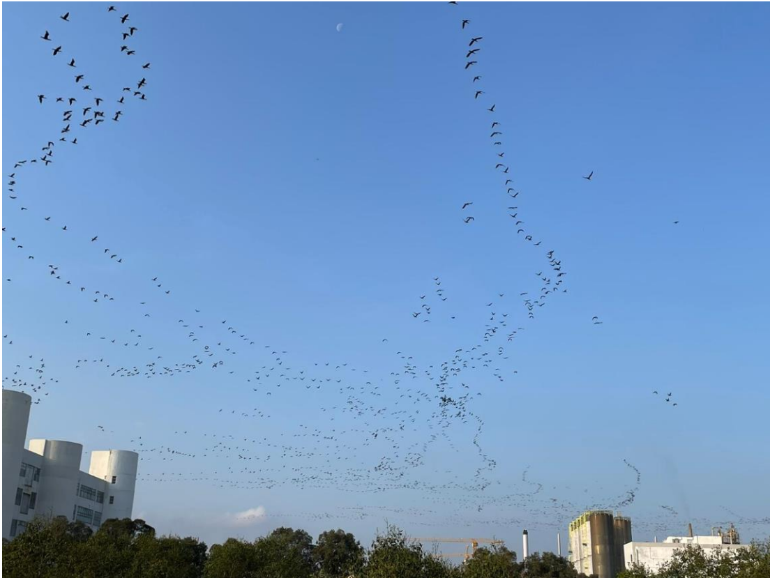
Annex G.1. Flock of Great Cormorants in Nam Sang Wai, far east of the Project Site.