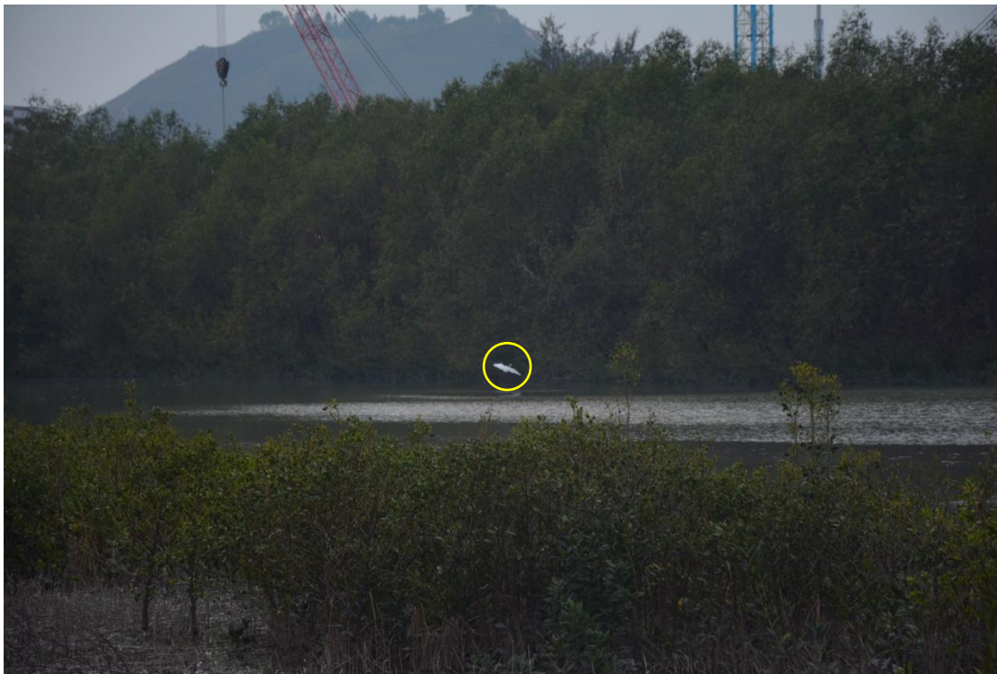
Appendix O.2.2a: Active night roost on Sonneratia apetala and S. caseolaris mangrove roosting substrate located east of the Project boundary observed on 16 February 2023 around 18:20