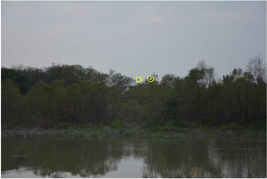
Appendix O.2.2b: Active night roost on Sonneratia apetala and S. caseolaris mangrove roosting substrate located northeast of the Project boundary observed on 16 February 2023 around 18:20