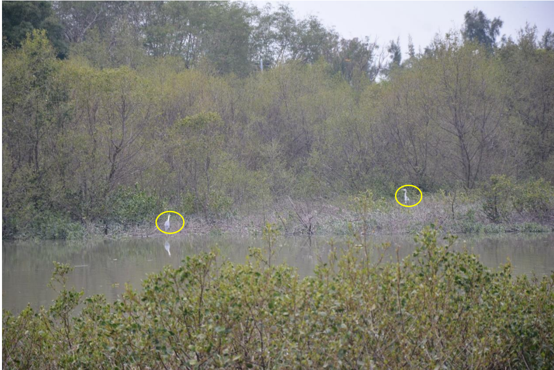
Appendix O.2.1a: Pre-roost aggregate of Grey Heron Ardea cinerea northeast of the Project boundary observed on 16 February 2023 around 17:55