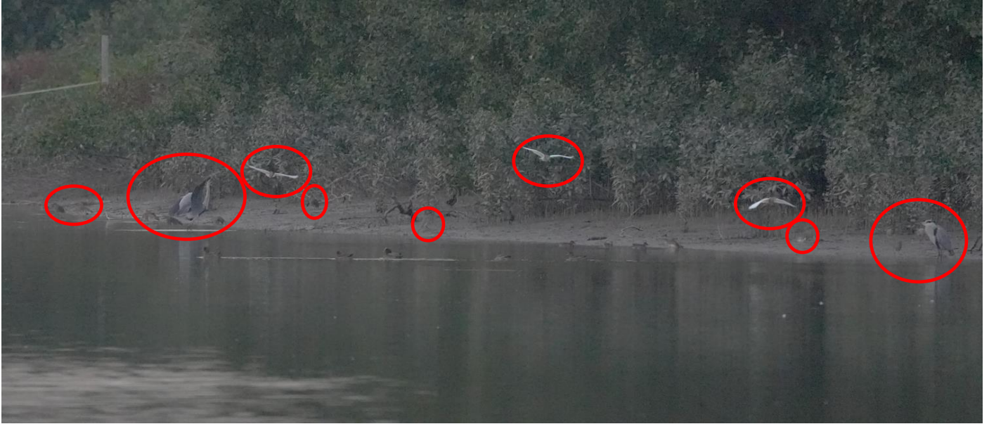
Appendix O.2.2a: Active night roost in the mudflat northeast side of the Project boundary (ANR2) observed on 21 November 2025 at around 17:29.