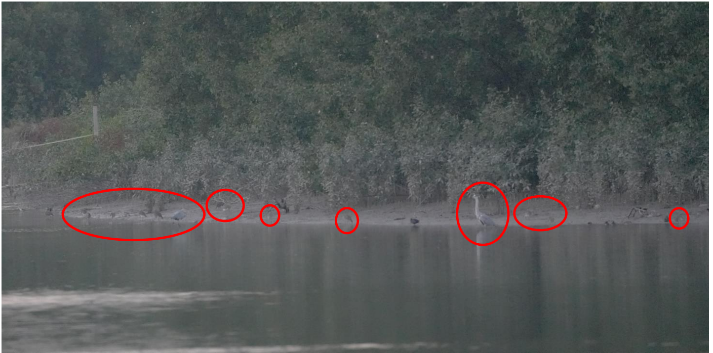
Appendix O.2.1a: Pre-roost aggregate of ardeids in the mudflat northeast side of the Project boundary (ANR2) observed on 21 November 2025 at around 17:15.