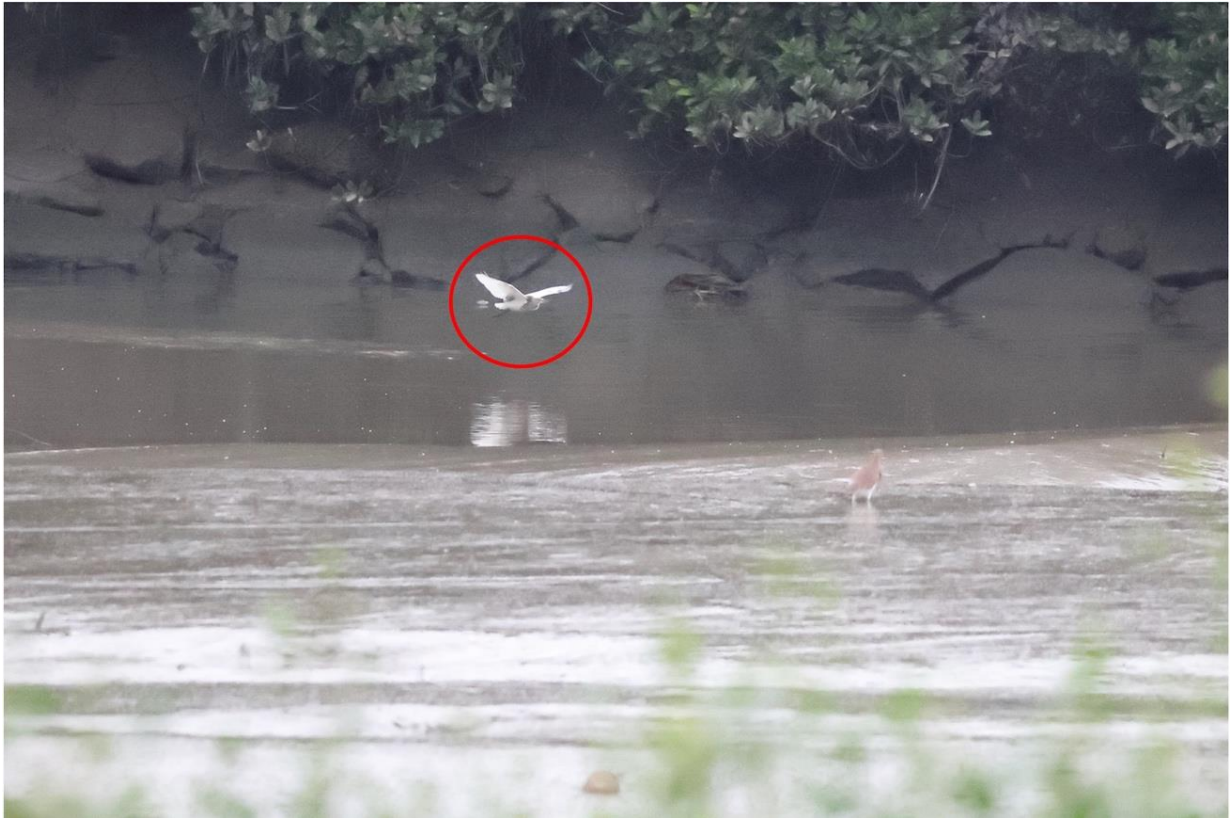
Appendix O.2.2a: Active night roost of Chinese Pond Heron Ardeola bacchus located northeast of the Project boundary observed on f the Project boundary observed on 21 September 2023 around 18:10.