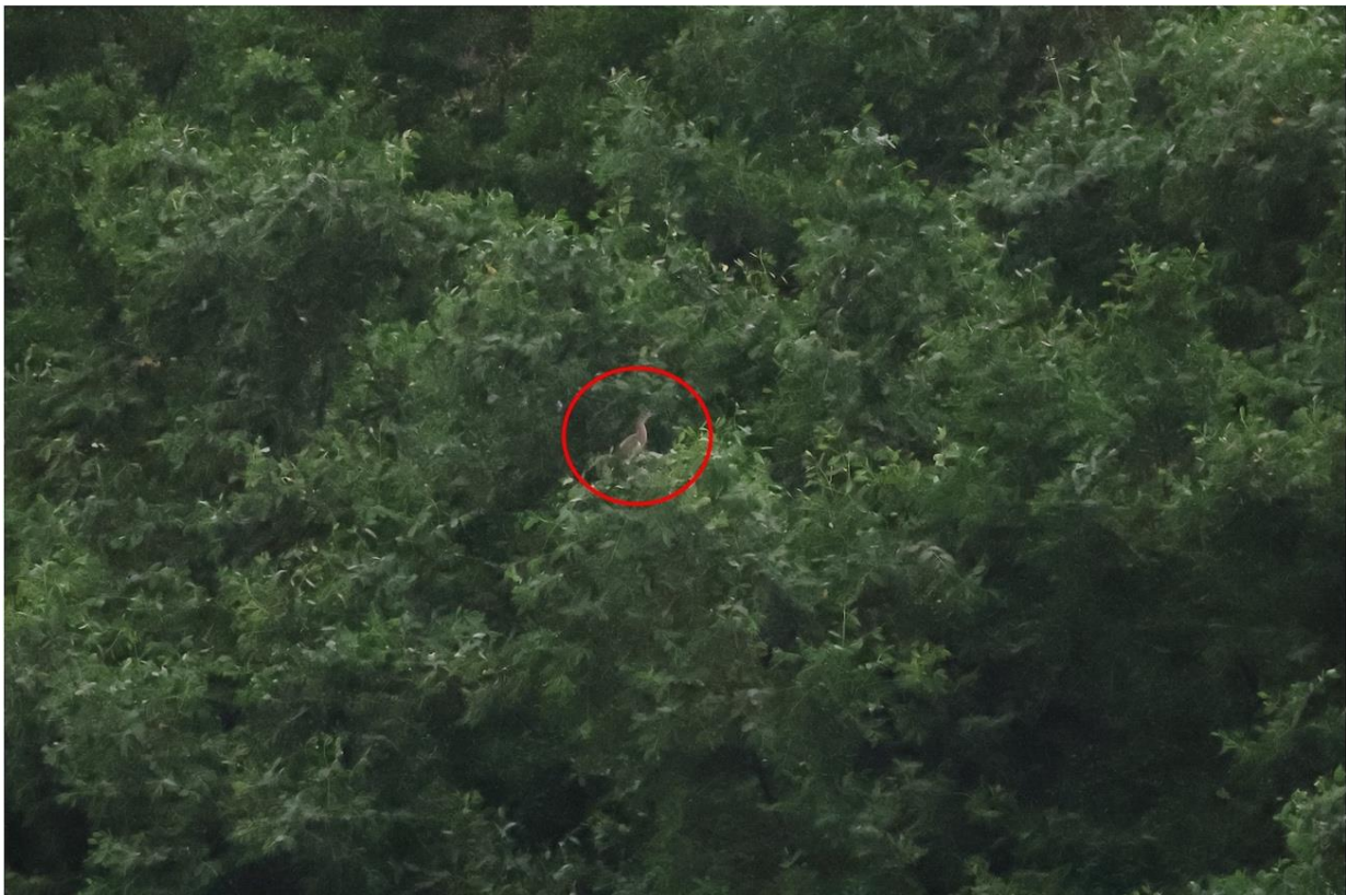
Appendix O.2.2b: Active night roost on Sonneratia apetala and S. caseolaris mangrove roosting substrate located northeast of the Project boundary observed on 21 September 2023 around 18:20.