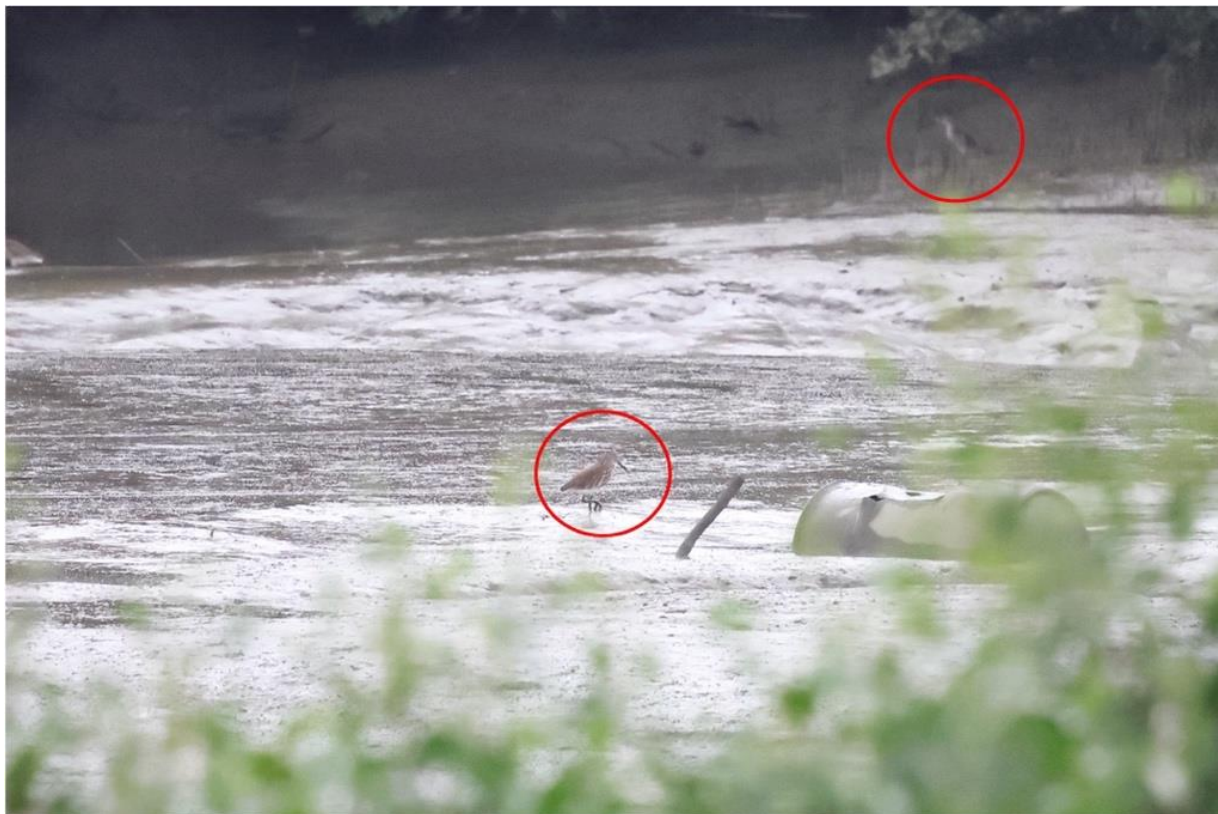
Appendix O.2.1a: Pre-roost aggregate of Chinese Pond Heron Ardeola bacchus in the mudflat area east of the Project boundary observed on 21 September 2023 around 18:02