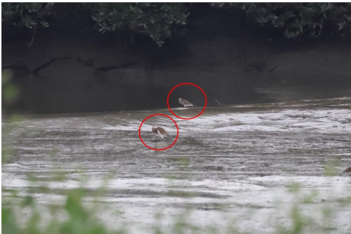
Appendix O.2.1b: Pre-roost aggregate of Chinese Pond Heron Ardeola bacchus in the mudflat area of the Project boundary observed on 21 September 2023 around 18:10