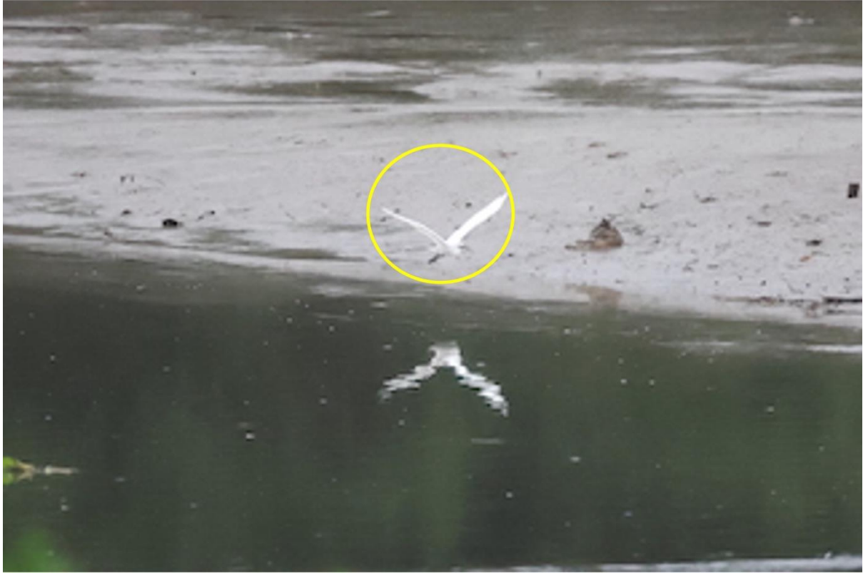
Appendix O.2.2a: Active night roost of Little Egret Egretta garzetta located northeast of the Project boundary observed on 31 August 2023 around 18:42.