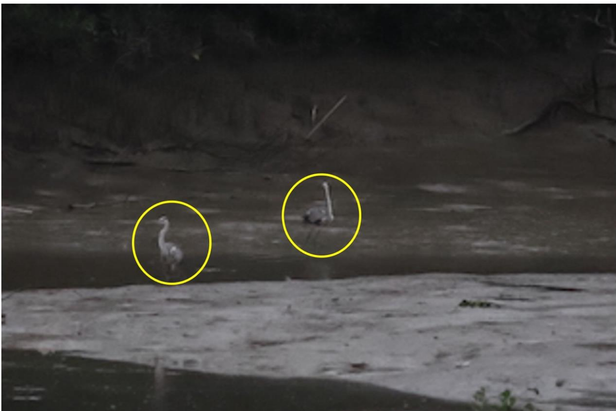
Appendix O.2.1b: Pre-roost aggregate of Grey Heron Ardea cinerea located northeast of the Project boundary observed on 31 August 2023 around 18:20.