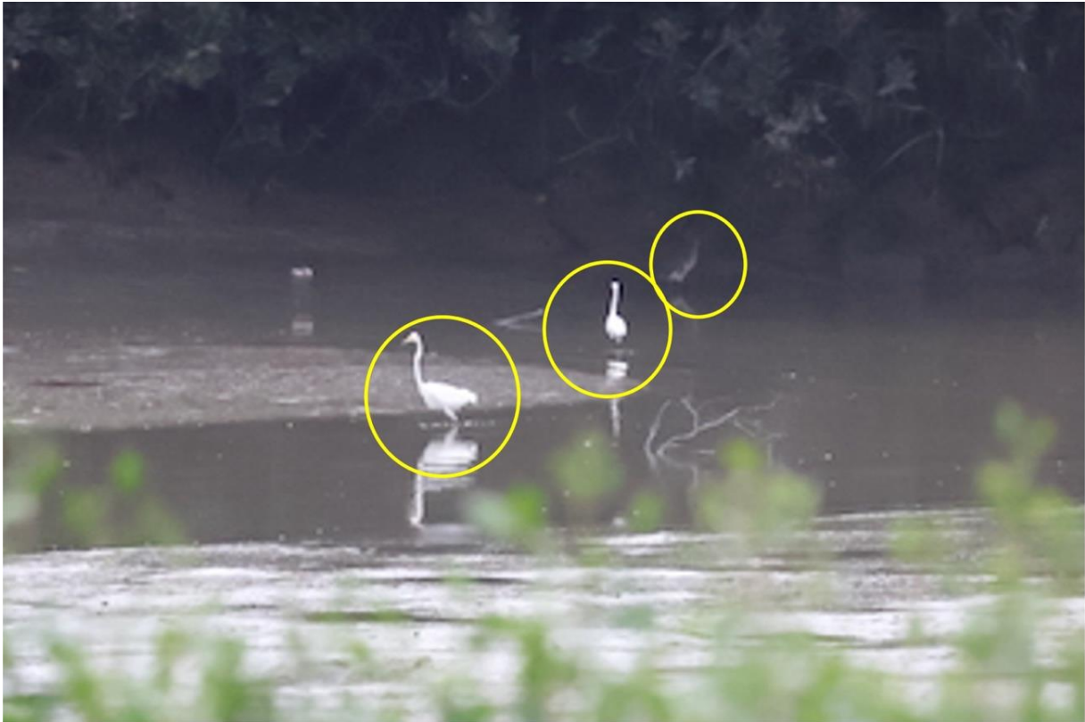
Appendix O.2.1a: Pre-roost aggregate of Great Egret Ardea alba , Little Egret Egretta garzetta and Chinese Pond Heron Ardeola bacchus located northeast of the Project boundary observed on 31 August 2023 around 18:15.